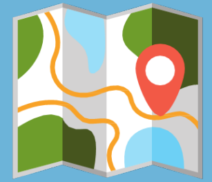
Traditional Redistricting Criteria