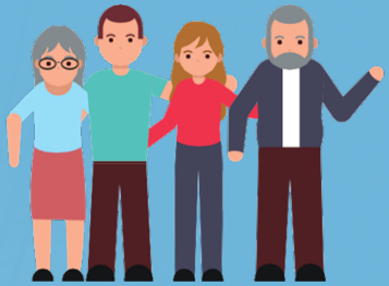
Equal Population Principle