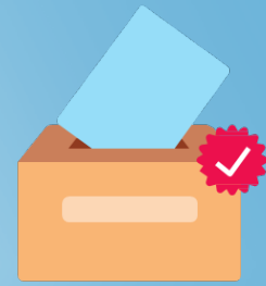
Voting Rights Act of 1965