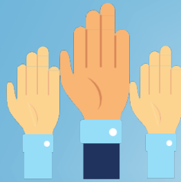
U.S. Constitution's Equal Protection Clause